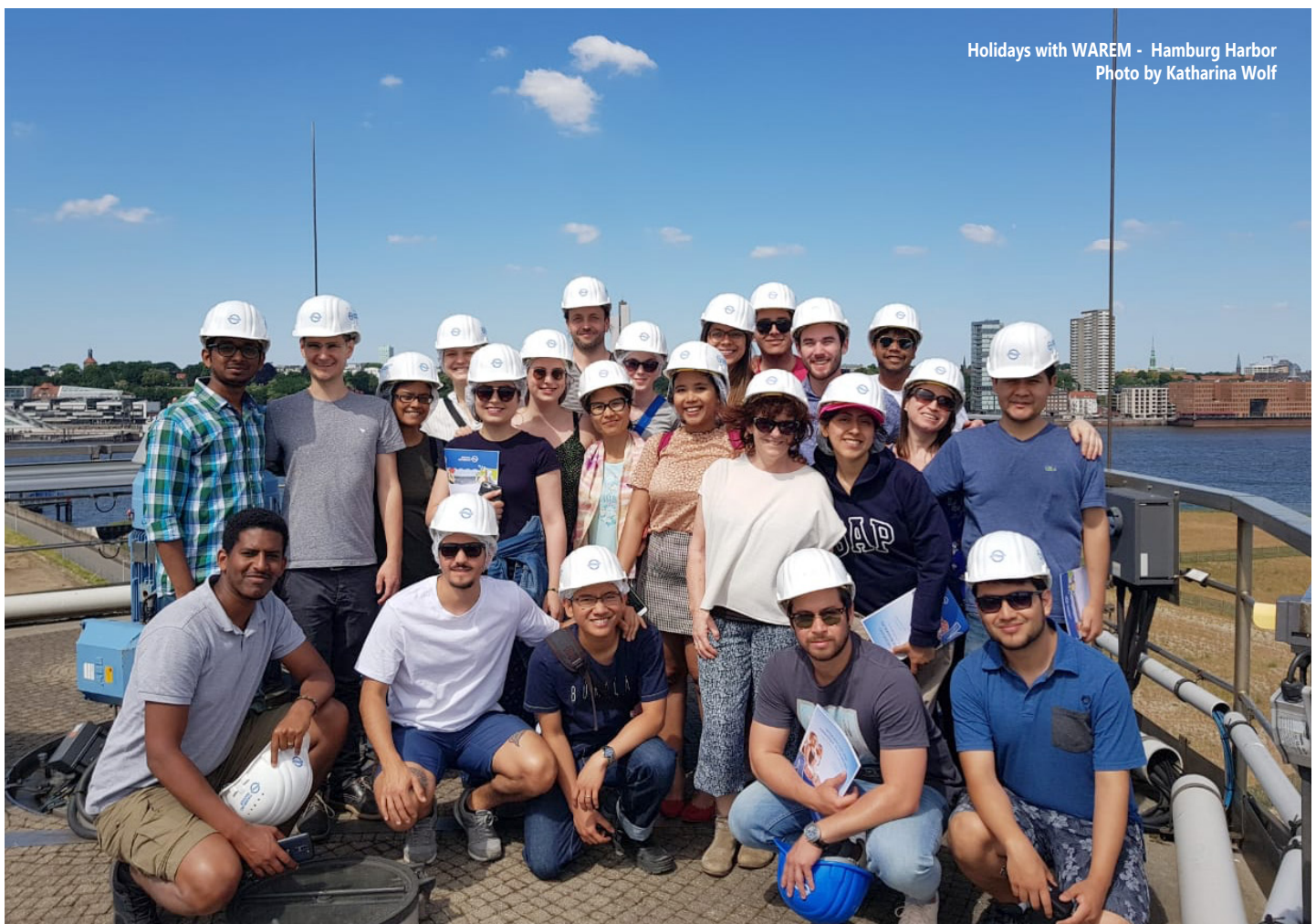
Holidays with WAREM - Hamburg Harbor