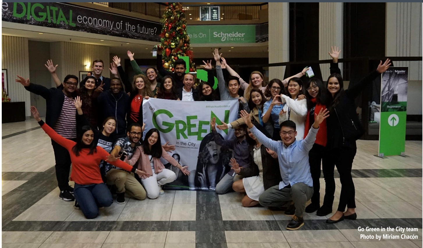
Go Green in the City team