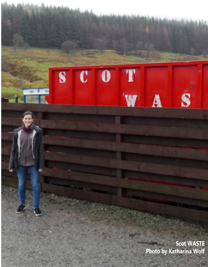
Scot WASTE