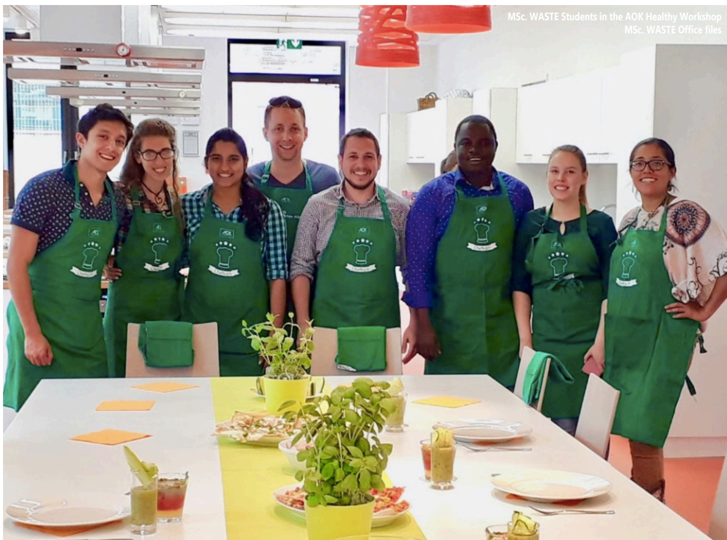
MSc. WASTE Students in the AOK Healthy Workshop