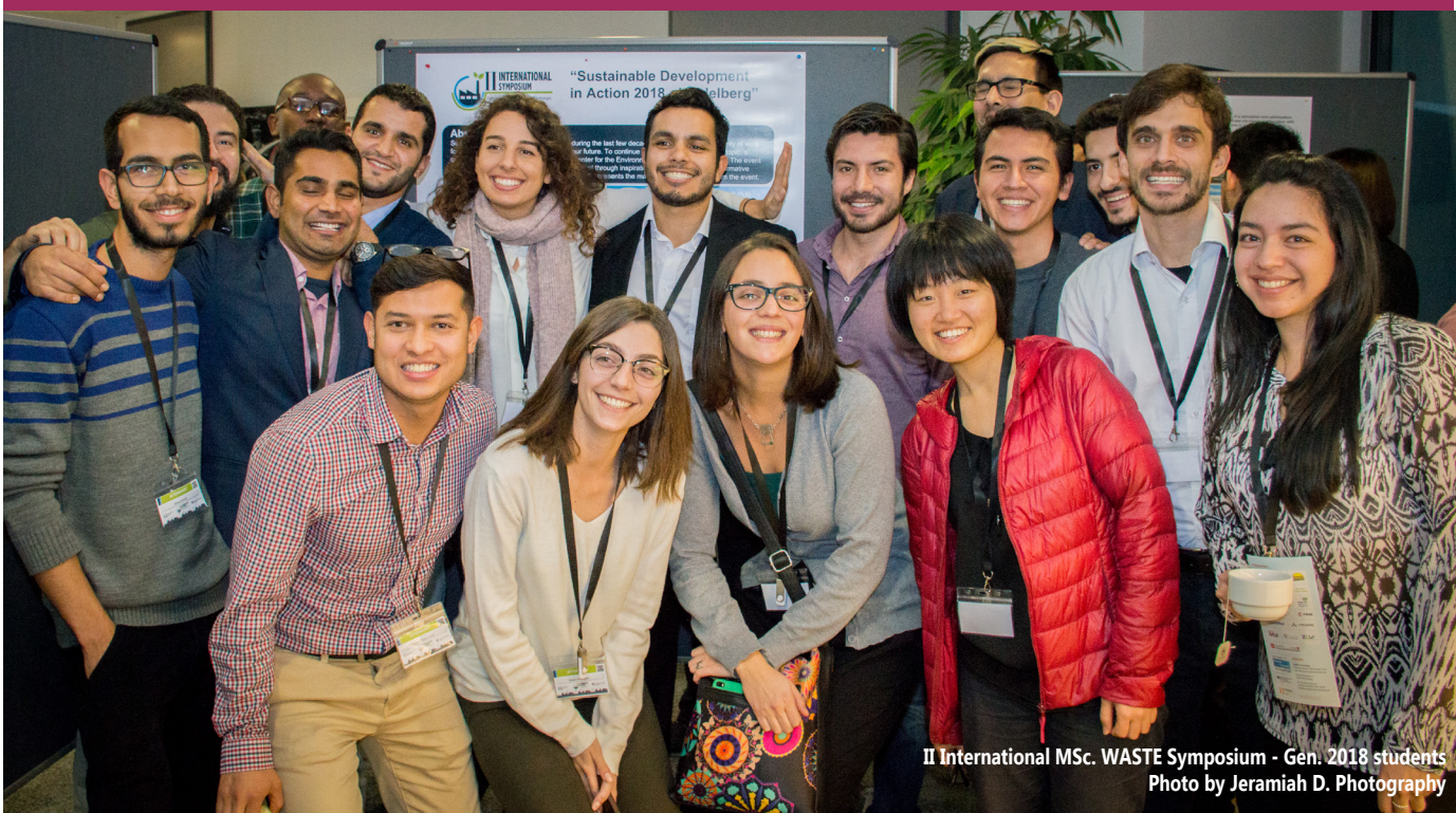
II International MSc. WASTE Symposium - Gen. 2018 students

„Clearly there are many benefits to attending and hosting conferences such as the Second International MSc. WASTE Symposium. It is not just about sharing ideas but also creating contacts. Contacts that can turn into great collaborations or even guide career paths. We need to work together, feed off each other's ideas, recognize the uniqueness of the problems, and develop solutions concurrently. Therefore, we need to network.“