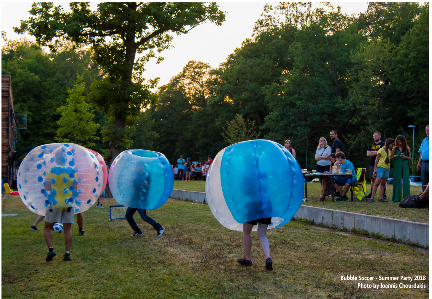
Bubble Soccer - Summer Party 2018