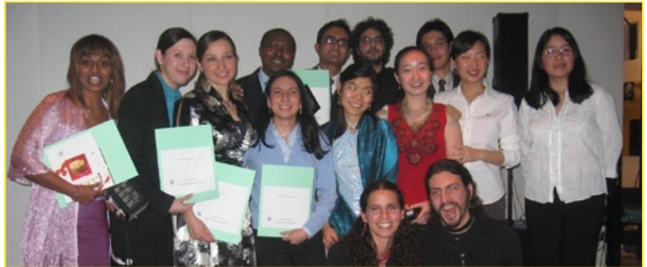
A group picture of 2006 graduates (most of them). They are the 4th generation of WASTE students already!